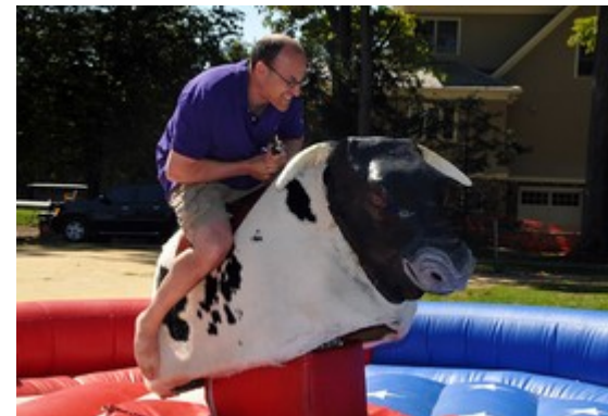
Even the dads had a great time...