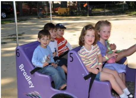
A "train" ride with friends on a sunny day...

26 Elul 5768 / September 26, 2008 Erev Shabbat Parashat Nitzavim Candle Lighting : 6:27 p.m.